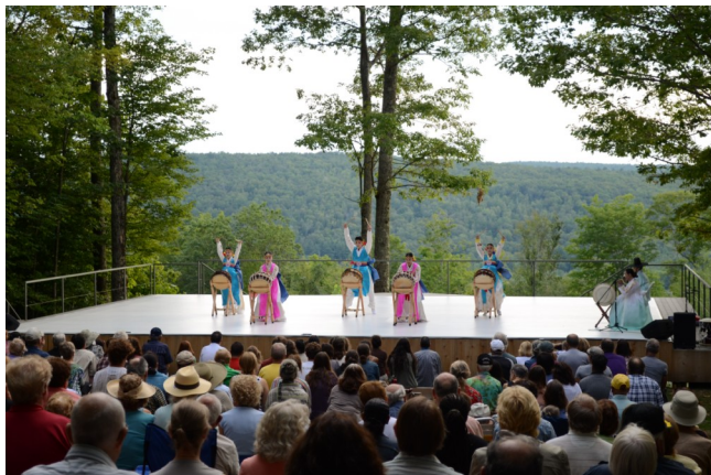
Jacob's Pillow, Becket, MA

Jacob's Pillow, the internationally-Acclaimed dance festival set in the Becket woods, showcases dancers on its Inside/Out Stage perched on a hillside. Every summer, the Pillow's two theaters host incomparable Performances by dance companies from around the world. Plan to spend the whole day on their extensive grounds. This is the magic of summer in the Berkshires: experiencing extraordinary natural beauty paired with superb performances, not only at Tanglewood and the Pillow, but at cultural venues, large and small, across the region.