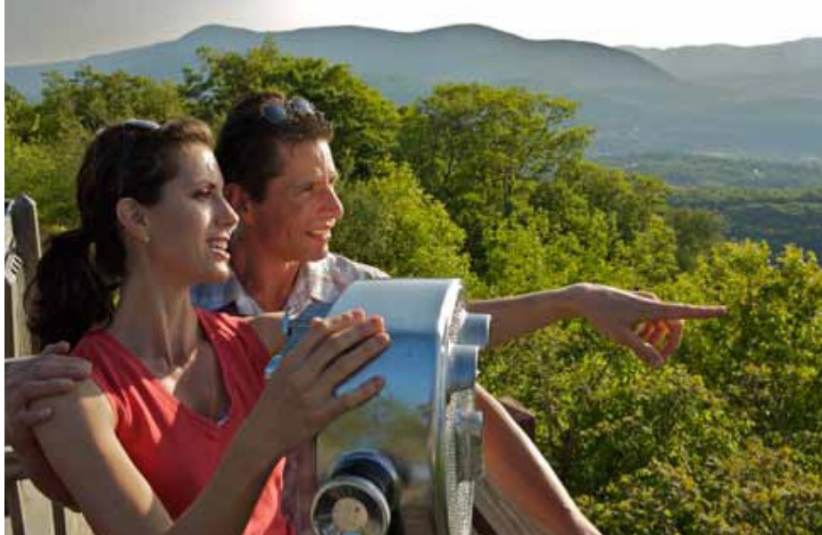
Hilltop Orchards, home of Furnace Brook Winery, Richmond, MA